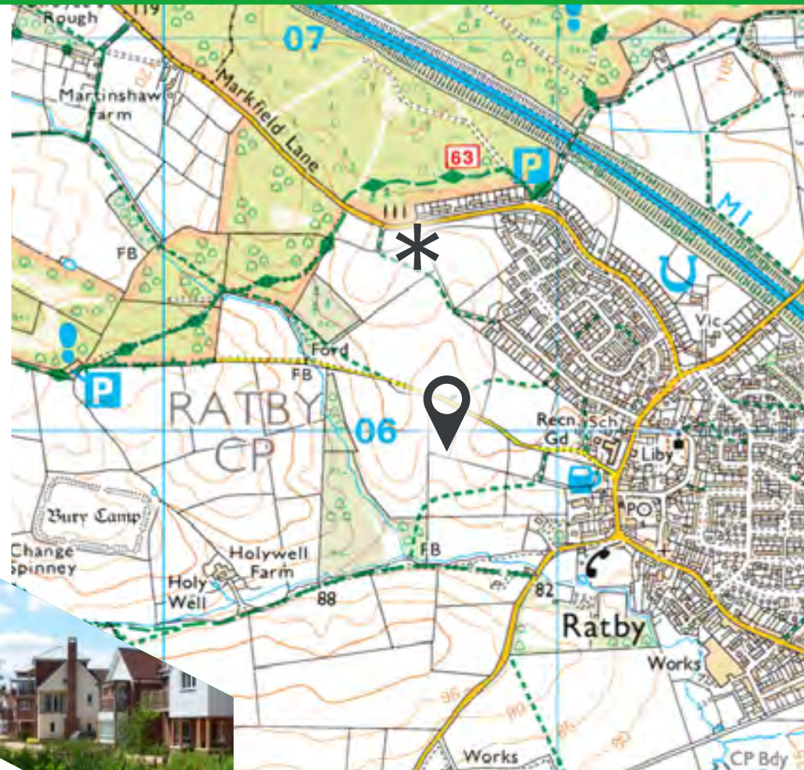
* Lagan Homes current sites 📍 Lagan Homes proposed site